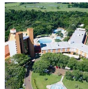
Convention Centre The venue of 'CIGR 2008'