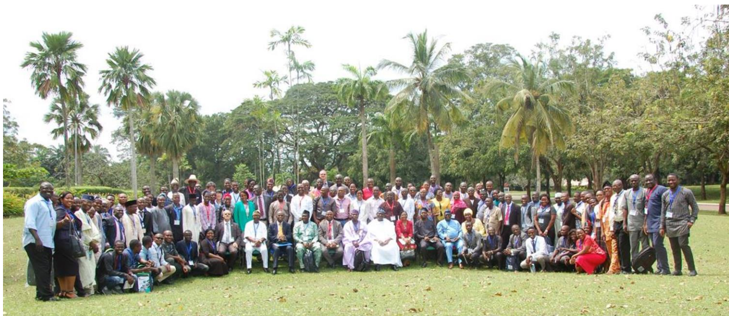
Participants in the 12 th CIGR Section VI Symposium

A social tour was organized for interested participants to the Aflasafe Plant as well as the Cassava Processing Plant, both at IITA, and the Museum at Cocoa House, Ibadan. Eight people participated in the tour.