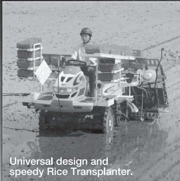
Universal design and speedy Rice Transplanter.