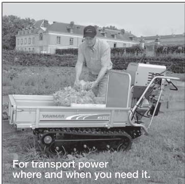
For transport power where and when you need it.