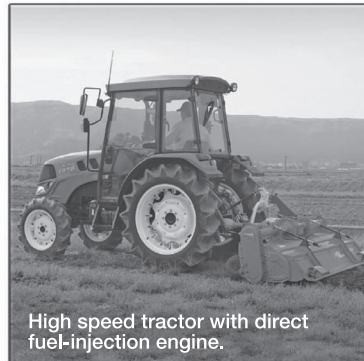
High speed tractor with direct fuel-injection engine.

YANMAR is dedicated to go beyond the engineering of technology, services and products with superior combustion, efficiency and durability. We also provide solutions to challenges faced by our customers.