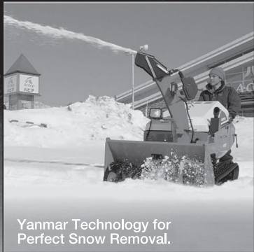
Yanmar Technology for Perfect Snow Removal.