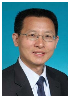
Prof. Guanhua Huang

The mission of CIGR-Section I is to promote the advance of the engineering science in the area of land and water use in agriculture and in rural areas, giving special attention to the conservation of resources, the preservation and re-establishment of environmental balances, and the social and economic impacts of applications in order to realize sustainable development for