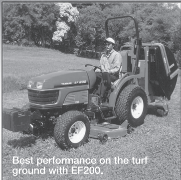
Best performance on the turf ground with EF200.