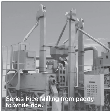
Series Rice Milling from paddy to white rice.