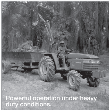
Powerful operation under heavy duty conditions.