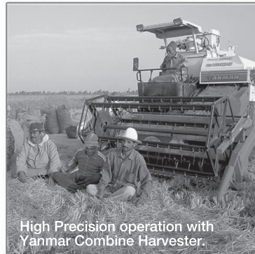
High Precision operation with Yanmar Combine Harvester.