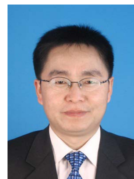
Dr. Wang Yingkuan

From April to September of the year 2011, 46 manuscripts have been submitted, which is a little more in number than 37 from January to March 2011. The average time to conduct a review and publish a manuscript is far more than 30 days (compared with the data from the first season). As we can see many submissions (91%, lower than 68% in the last season) were in the queue awaiting