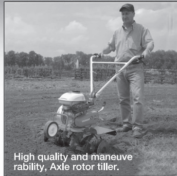
High quality and maneuverability, Axle rotor tiller.