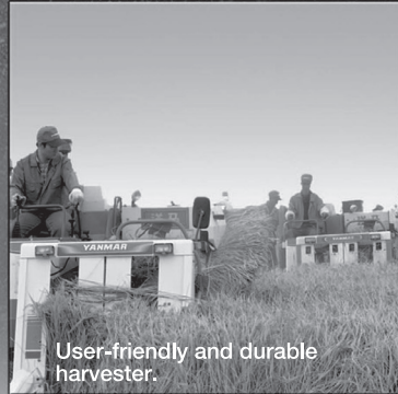
User-friendly and durable harvester.