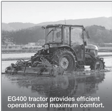
EG400 tractor provides efficient operation and maximum comfort.