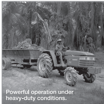
Powerful operation under heavy-duty conditions.