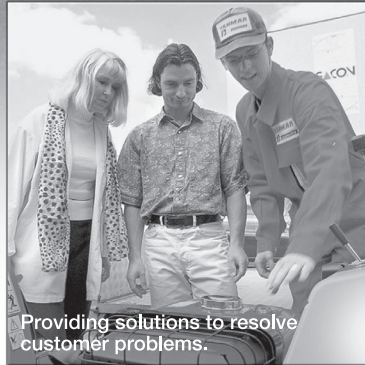
Providing solutions to resolve customer problems.