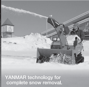
YANMAR technology for complete snow removal.