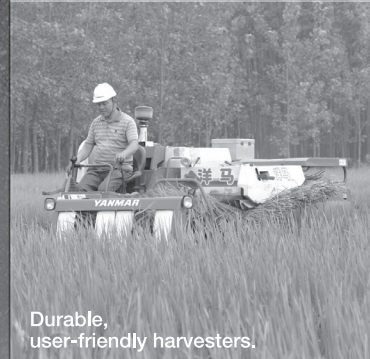
Durable, user-friendly harvesters.