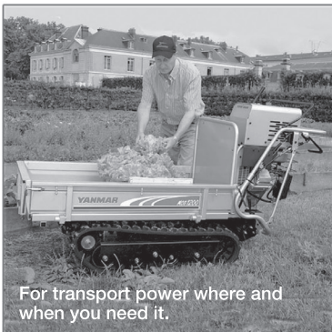
For transport power where and when you need it.