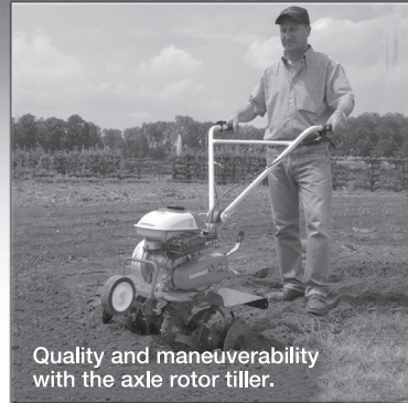
Quality and maneuverability with the axle rotor tiller.