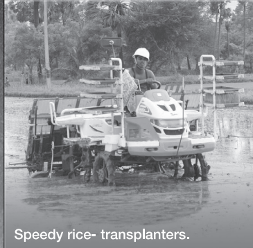
Speedy rice- transplanters.