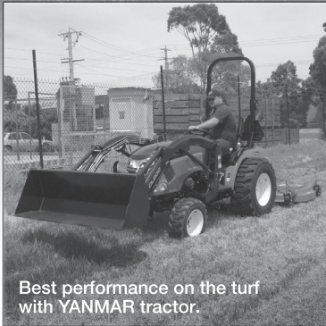
Best performance on the turf with YANMAR tractor.