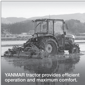
YANMAR tractor provides efficient operation and maximum comfort.