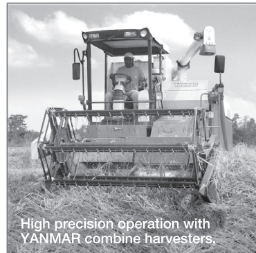
High precision operation with YANMAR combine harvesters.