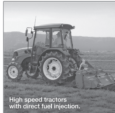
High speed tractors with direct fuel injection.

YANMAR is dedicated to going beyond the engineering of technology, providing exceptional services and products with superior combustion, efficiency and durability. We also provide solutions to challenges faced by our customers.